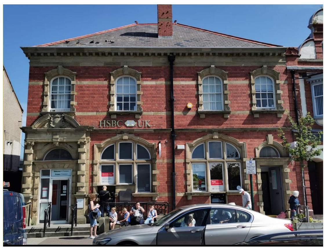
Prestatyn branch 2019